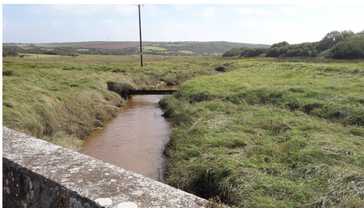
The view from Mullock Bridge looking across the marsh towards Dale to the south

Mullock Bridge marks the highest point reached by the tide coming up the inlet from Dale. The stream which flows under the bridge could well reach a depth suitable for baptism – by immersion, as is the practice in the LDS Church - at high tide, and may well have been the site of Mary’s baptism.