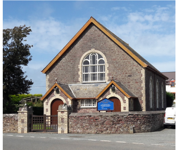
Moriah Baptist chapel, Marloes

I preached at Marloes in the open air to about three hundred people. The Baptist choir came out and sang for me, the leader played his clarinet and the people listened with the greatest of pleasure, although it rained during the meeting. After the meeting, the people came forward to shake hands with me and gave me money, some two pence, some three pence, and one person gave me a shilling. It seemed to me like the widow's mite. I thanked and asked God to bless them. They invited me to come again. They were God's poor, and my heart was so filled with love for them that I could not keep from shedding tears. I felt as if the disciples of Jesus were there.